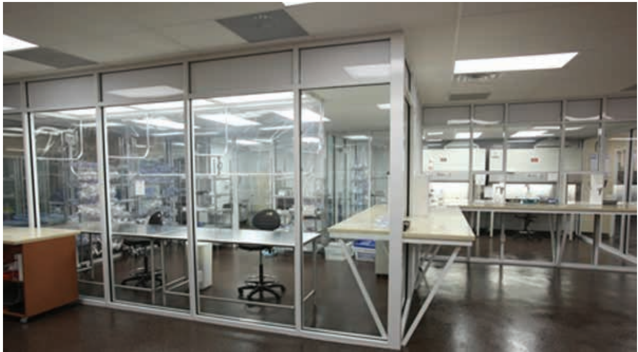
Oncology Plus Compliant Cleanroom Designed & Built By Carter-Health

Carter-Health is a proud vendor for the following GPO's: